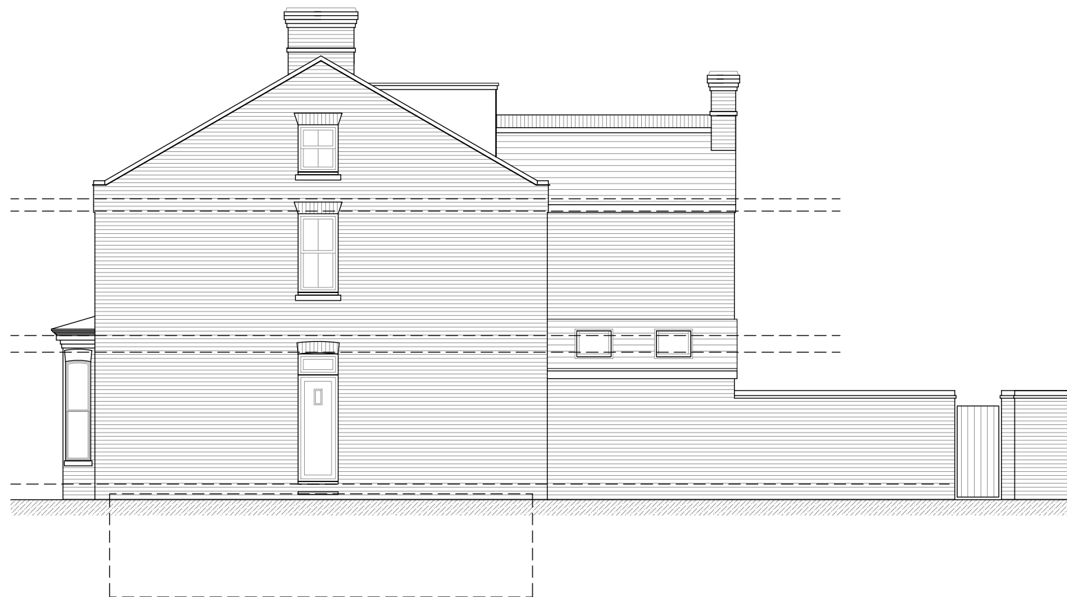
Side (South-West Facing) Elevation 1:100