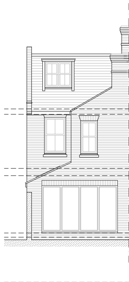
Rear (South-East Facing) Elevation 1:100